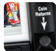
Full change system